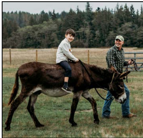
Private party at Bowman Farms.