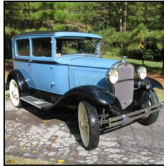
Caravan and Picnic in Model A.