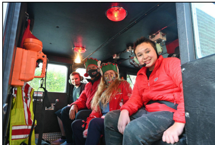
Clallam Co. Dist. 3 picks up Kingston from school.

Thank you to everyone who was able to support PBH's first-ever online auction fundraising efforts! We may have to do it again sometime!