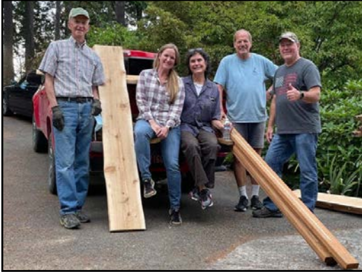
Nor'Wester work crew for hire.