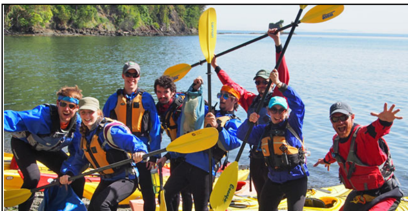
Guided Tour of the Whale Trail. Photo and Experience by Adventures Through Kayaking