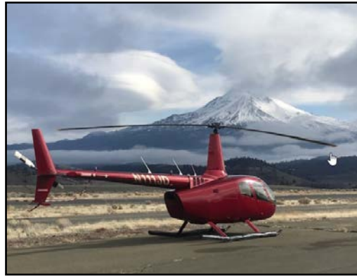
An Hour Long Scenic Flight Over the Olympic Peninsula.

We knew we couldn't hold an in-person event, but we couldn't give up on our efforts to raise money for our clients. We got creative and came up with a super fun idea that we called The Adventure Auction . If the pandemic has taught us anything it's that we need to build memories with friends and family.