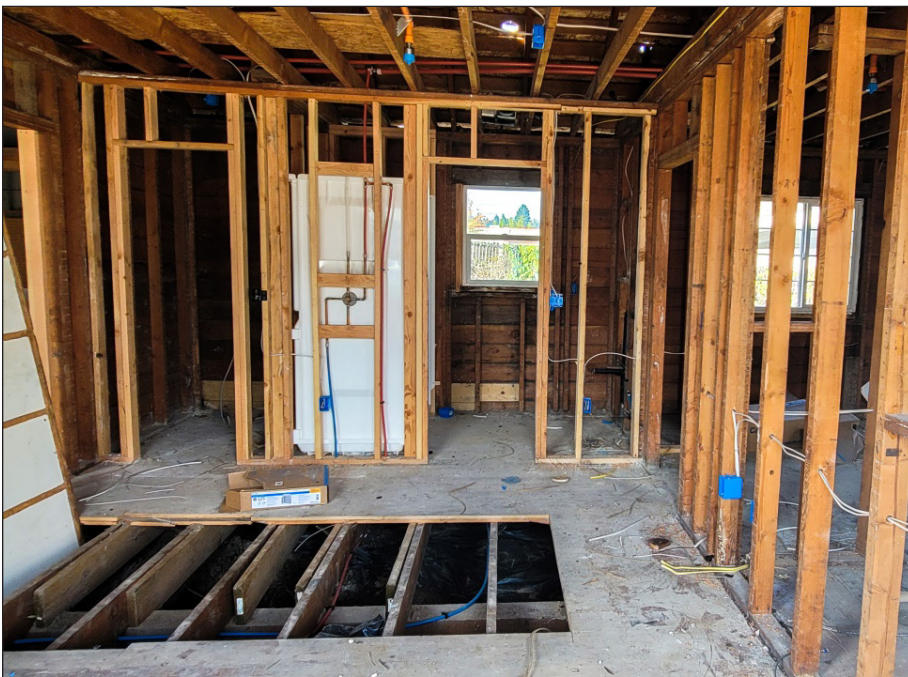
View from the inside of Dawn View Court during construction. PBH is doing a complete renovation including new insulation and plumbing.