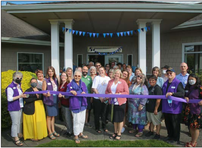
New Sequim Office Ribbon Cutting on June 27th, 2022