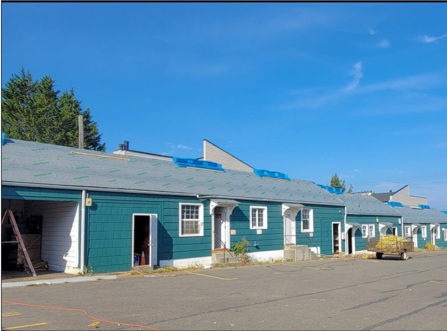
Dawn View Court , the former All View Hotel, getting a new roof!